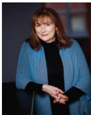
Scientist as Educational Entrepreneur Arrowsmith Program Education and Educational Therapy