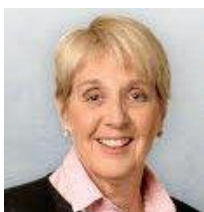
Chair BTA IAB; Independent Director BTA Investment Advisors; John Hancock Natural Resource Group International Finance