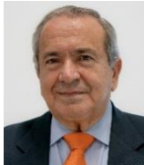
Rector University Camilo José Cela University Education