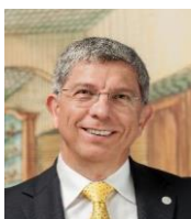
Rector Freiburg University of Mining and Technology University Education, International Business and Energy